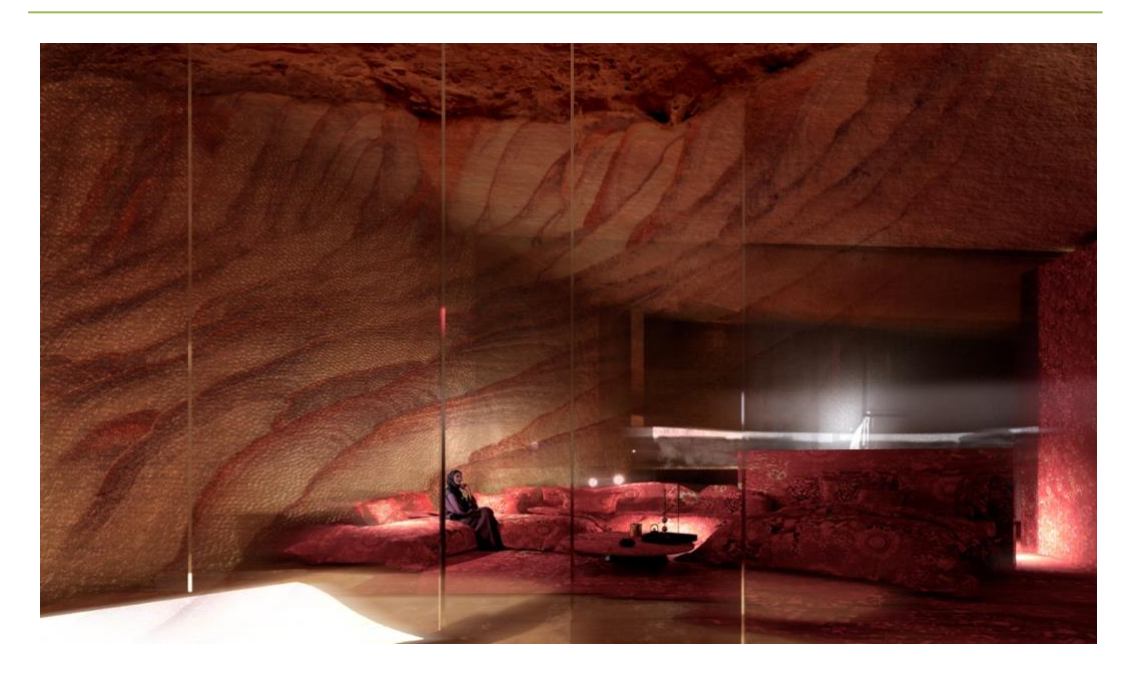
The resort embraces the natural colours and materials of AlUla in luxury.