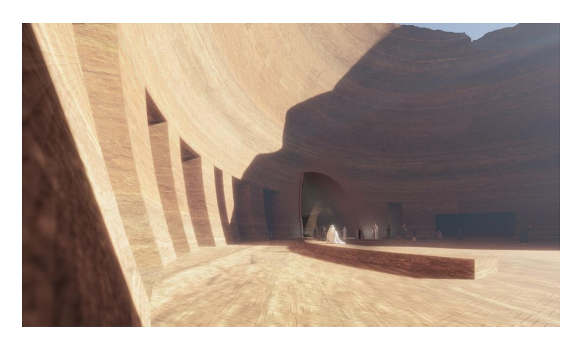
Inner courtyard resort concept: "Architecture is there to put its stamp on places and bear witness to the evolving spirit of the times." -Jean Nouvel