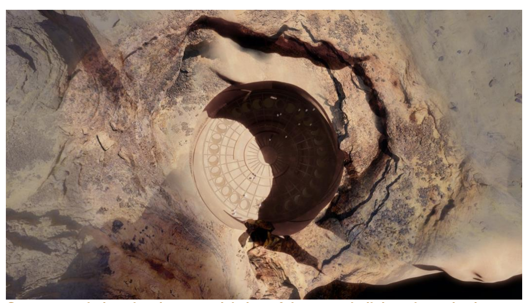
Concept rendering showing an aerial view of the resort built into the majestic Sharaan Nature Reserve.