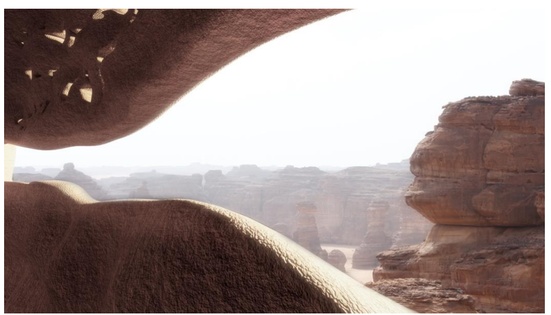
Design displaying the view from within the resort over the landscape of Sharaan "Every urban act is an act of architecture. Our overall strategy should flow from site-sensitive rules." -Jean Nouvel