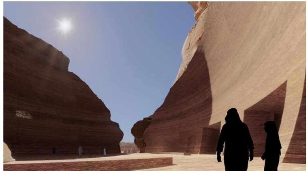
The designs shows guests within the resort built into the landscape (patio)