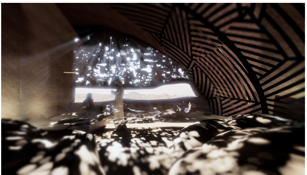
Nouvel views this resort as an opportunity to bring to life a strong spatial, sensorial and emotional experience on the borders of nature, architecture and art – where the sound, musicality, harshness, tactility, power and complexity of nature are everywhere, from finely chopped stones on balconies to the singular granularity of each rock wall, all becomes an artwork in itself.