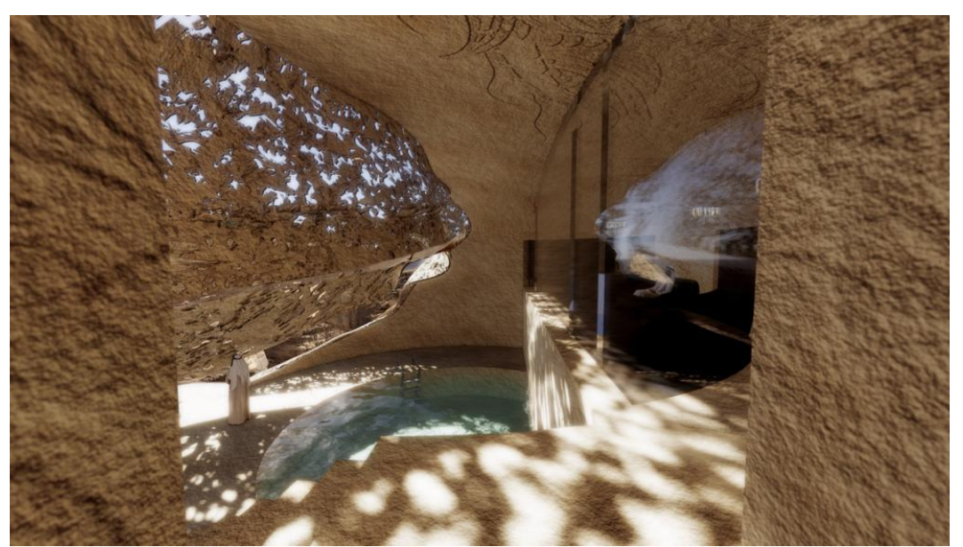
Concept rendering of a pool area displaying the interaction of modern designs mixed with the Nabatean way of using light, shadow and rocks.