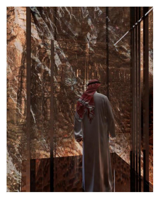
A scenic express lift will bring guests to the heart of the resort, allowing them to travel through millions of years of geological stratas.