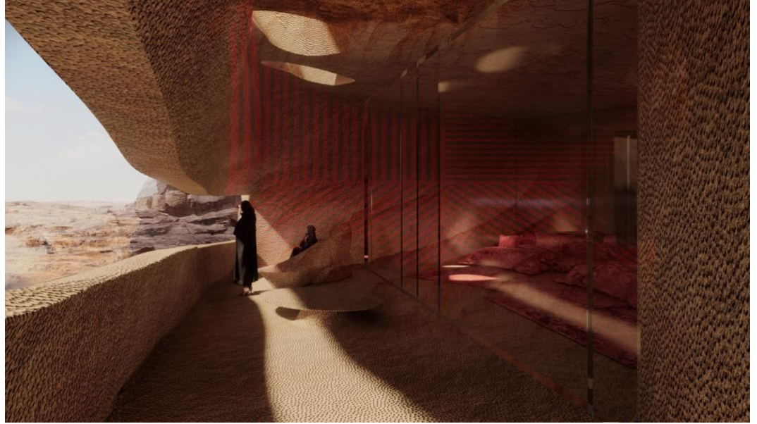
Design of one of the resort's rooms with terrace: "Our design principles will guide us as we explore new typologies that reconcile heritage alongside the subtle transformation of the existing architecture." -Jean Nouvel