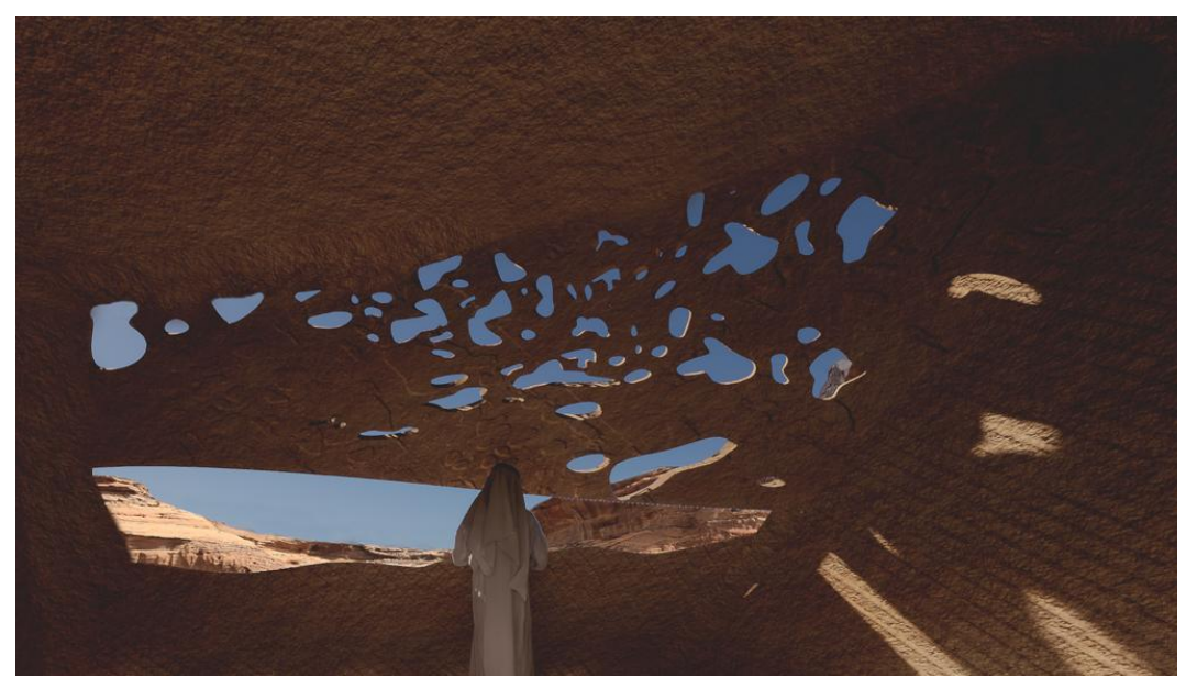
Concept rendering showing the view from within the resort over the landscape of the Sharaan Nature Reserve.