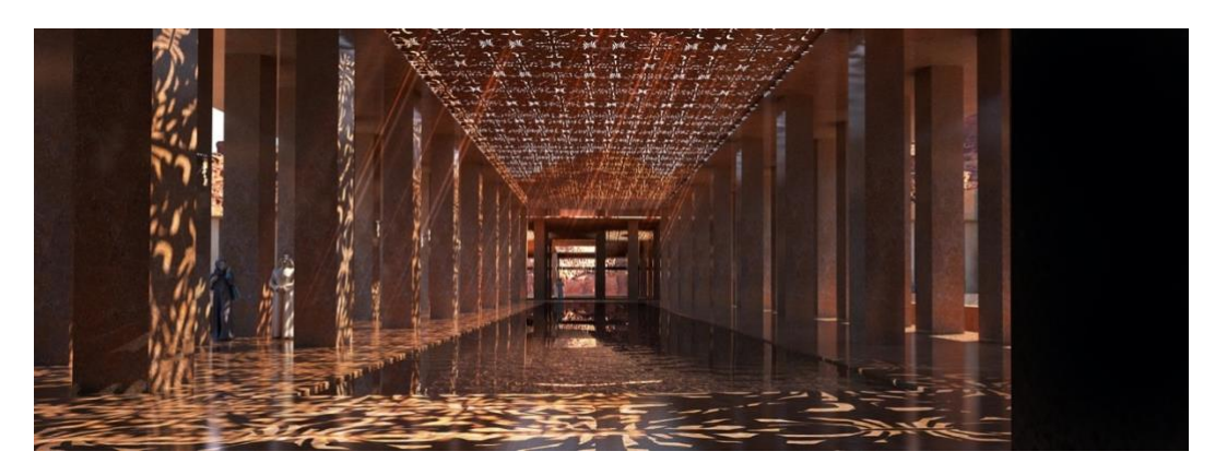
These concept renderings show the resort's luxurious embrace of AlUla's natural colours, light, shapes, and materials.